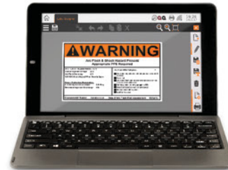
The 10" touchscreen may be used as a standalone tablet or attached to the printer.

The brain behind the DL9000 PS is its 10" touchscreen tablet. Attached to the side of the printer is an ergonomically adjustable bracket, which may be used with the tablet to create a print station. Use the touchscreen to select your sign or label elements or use the detachable keyboard with trackpad.