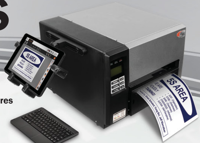
DuraLabel 9000 PS

Industrial Sign & Label Print Station | by Graphic Products, Inc.