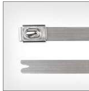
Stainless Steel Cable Ties, uncoated, MBT_SS, MBT_HS.