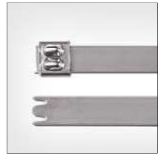
Stainless Steel Cable Ties, uncoated, MBT_XHS.