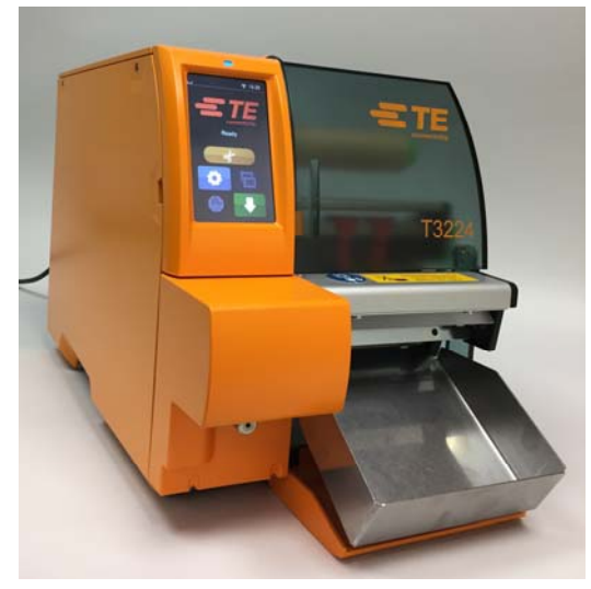
T3224 fitted with a Cutter & catch tray