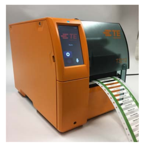
T3212 printing marker sleeves