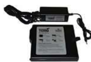
DLT Battery (Charger Included)