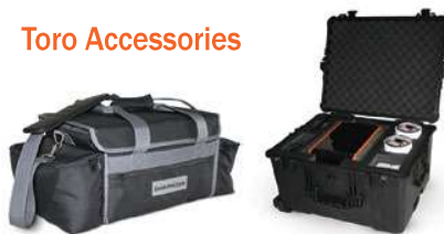
Soft Carrying Case