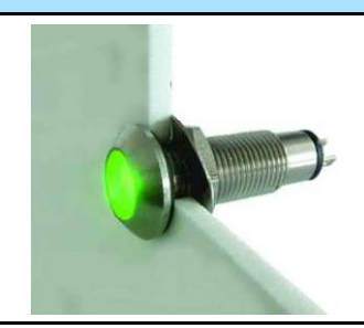
Ø8.1mm Mounting Robust Stainless Steel Housing Coloured Diffused Lens High Intensity LED Colours Bi-Polar AC/DC - Voltage Options Sealed to IP67 - Weatherproof Durable to Shock and Vibration