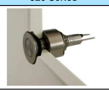
Ø6.1mm Countersunk Mounting Robust Stainless Steel Housing Coloured Diffused Lens High Intensity LED Colours Internal Resistor - Voltage Options Sealed to IP67 - Weatherproof Durable to Shock and Vibration