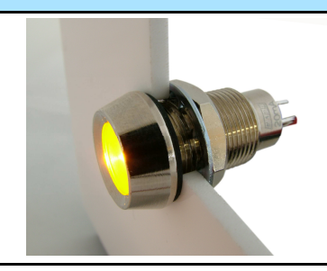
Ø12.7mm (½") Mounting Bright Nickel Plated Brass Housing Smoked Lens - Good On/Off Ratio High Intensity LED Colours Internal Resistor - Voltage Options Sealed to IP67 - Weatherproof Durable to Shock and Vibration