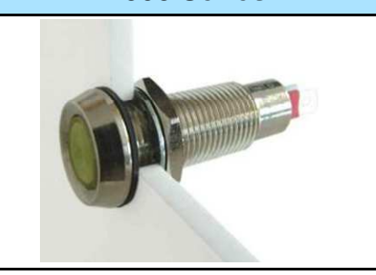
Ø8.1mm Mounting Bright Nickel Plated Brass Housing Smoked Lens - Good On/Off Ratio High Intensity LED Colours Internal Resistor - Voltage Options Sealed to IP67 - Weatherproof Durable to Shock and Vibration