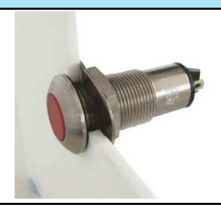
Ø12.7mm (½") Mounting Robust Stainless Steel Housing Coloured Diffused Lens High Intensity LED Colours Internal Resistor - Voltage Options Sealed to IP67 - Weatherproof Durable to Shock and Vibration