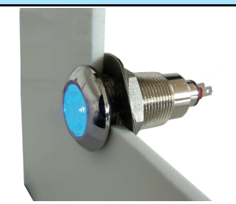
Ø12.7mm (½") Mounting Bright Nickel Plated Brass Housing Coloured Diffused Lens High Intensity LED Colours Bi-Polar AC/DC - Voltage Options Sealed to IP67 - Weatherproof Durable to Shock and Vibration