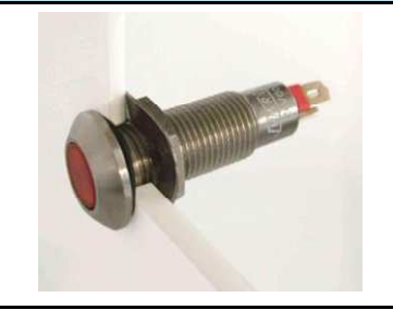
Ø8.1mm Mounting Robust Stainless Steel Housing Coloured Diffused Lens High Intensity LED Colours Internal Resistor - Voltage Options Sealed to IP67 - Weatherproof Durable to Shock and Vibration