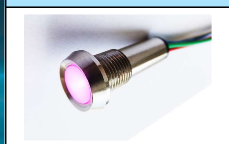
Ø8.1mm Mounting Bright Nickel Plated Brass Housing White Lens - Good On/Off Ratio Multi LED Colours - Single Indicator Input 12Vdc - 4 Wire Termination Sealed to IP67 - Weatherproof Durable to Shock and Vibration