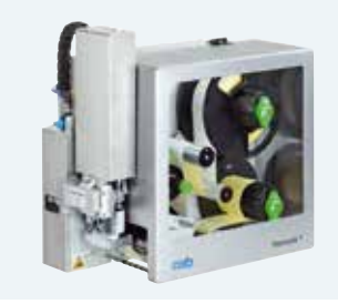
Ribbons in wax, resin and resin/wax qualities