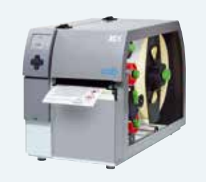
Labels made from more than 400 materials