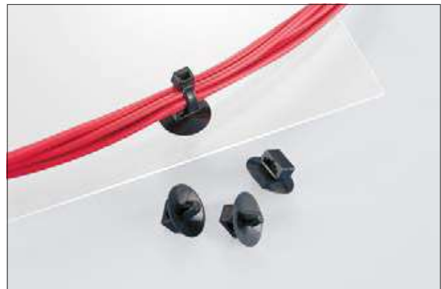
Securely fix and route cables and pipes with SFC3.