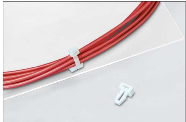
TM1SF Fixing Base for pre-drilled or pre-punched holes.