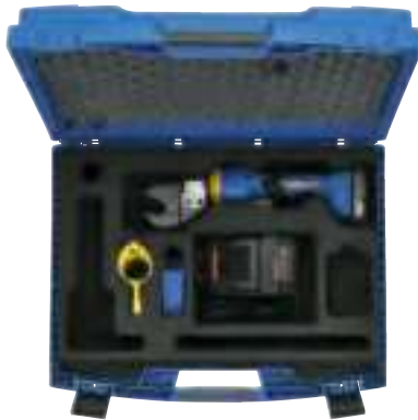
Scope of supply for ES 20 RMC