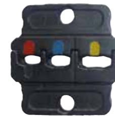
IS5071 For insulated Connector 0.5 - 6 mm 2