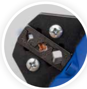
Best crimping results

What makes the Klauke micro so unique is its innovative operating concept with PowerSense function. Workpiece pre-clamping is done by hand – with the familiar precision and speed of mechanical crimping pliers. The stripping, cutting or crimping operation is performed automatically using the force of the integrated motor.