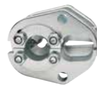
SD5010 For 10 mm 2 conductor