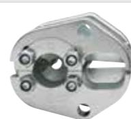
SD5006 For 6 mm 2 conductor (optionally available, not supplied as standard)