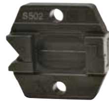
S502 Cutting die

Thanks to the new S502 cutting die, the Klauke micro gains a whole new function. A simple change of die now transforms the Klauke micro into a cutting tool. This makes it possible to cut double-loop chains, Class 2 cables up to 25 mm 2 , copper busbars up to 3 mm × 10 mm, or steel cables up to 3 mm.