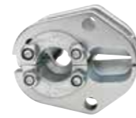
SD5025 For 25 mm 2 conductor