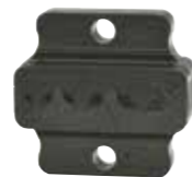
AE5071 for cable end-sleeves 0.5 - 6 mm 2