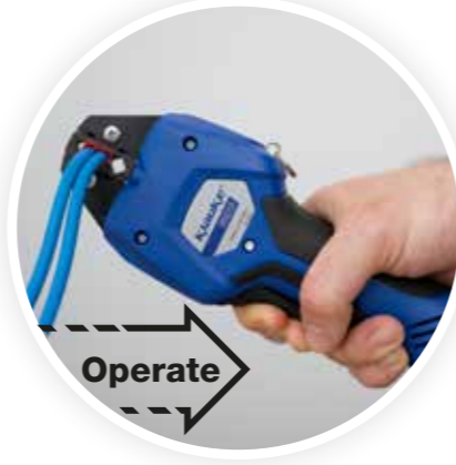
Motorized stripping / crimping / cutting