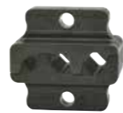
ZAE5072 for twin cable end-sleeves 2x6 - 2x16 mm 2