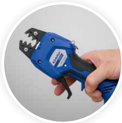
Ready whenever you need it