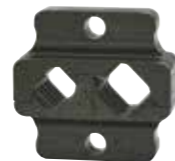
AE5073 for cable end-sleeves 35 - 50 mm 2