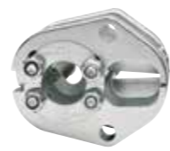
SD5016 For 16 mm 2 conductor