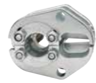
SD5035 For 35 mm 2 conductor