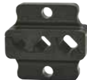
AE5072 for cable end-sleeves 10 - 25 mm 2