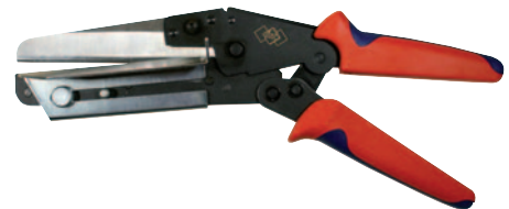
DX-110 cutter for trunking 0518 0918 000 D4/6-01