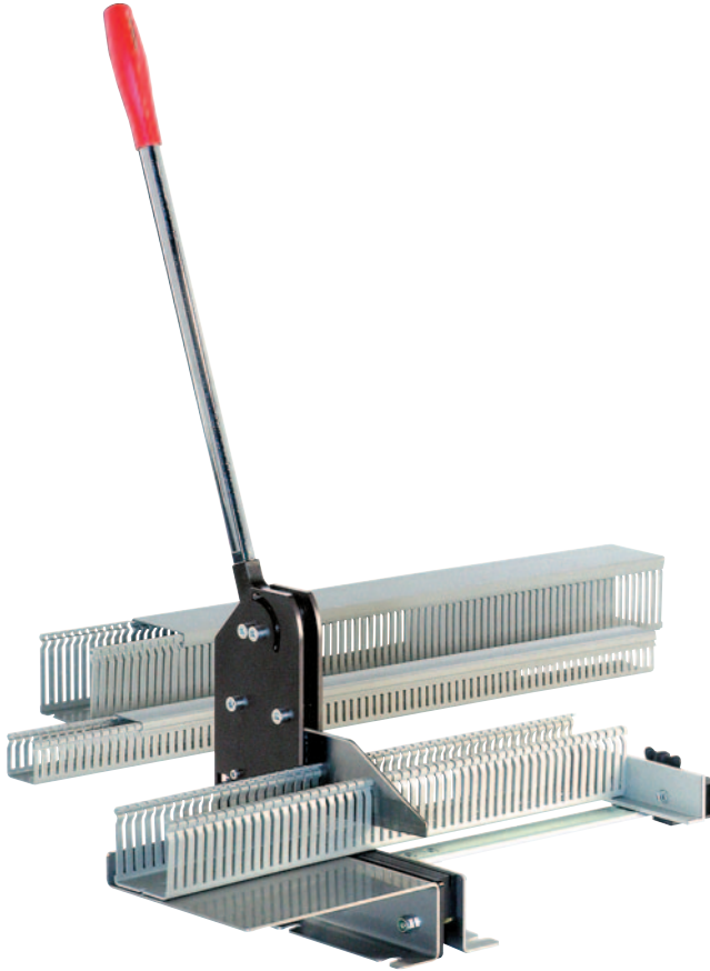
DC 125 cutter for trunking 0518 0960 000 C3/7-01

For a fast cut of our conduit trunking, SES-STERLING offers a selection of special tools .