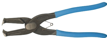
DK-55 cutting tool 0518 0956 000 D4/6-01